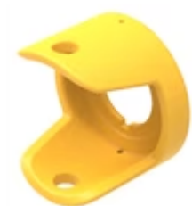
84-906 E-stop protective shroud